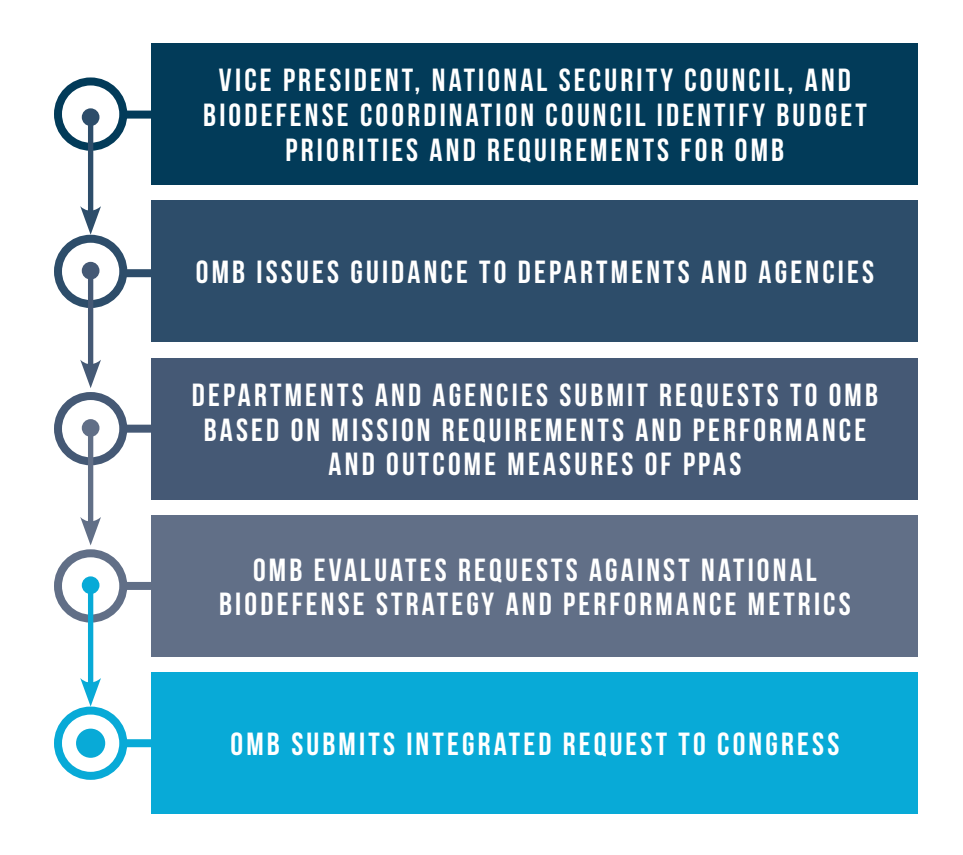
FIGURE 3 Process for Developing the Biodefense Budget

requested, and the following four fiscal years. This display of and plan for predicted expenditures would force advanced and strategic planning, encourage private sector participation, and enable Congress to consider at least five years of cost data during the appropriations process.